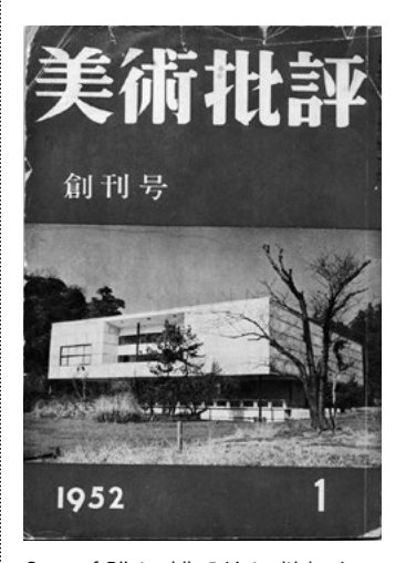
Cover of Bijutsu hihyō (Art criticism), no. 1 (January 1952), featuring an image of the Kanagawa Prefectural Museum of Modern Art, Kamakura

A third important factor in this shift in criticism was an increase in annual exhibitions, including the Japan Independent (1947–) and the Yomiuri Independent (1949–63). A wide range of avant-garde practices that emerged around 1950 in the context of these seasonal exhibitions exceeded or deviated from the dilettantism or romanticism that was the purview of traditional art criticism, and thus demanded a completely different form of