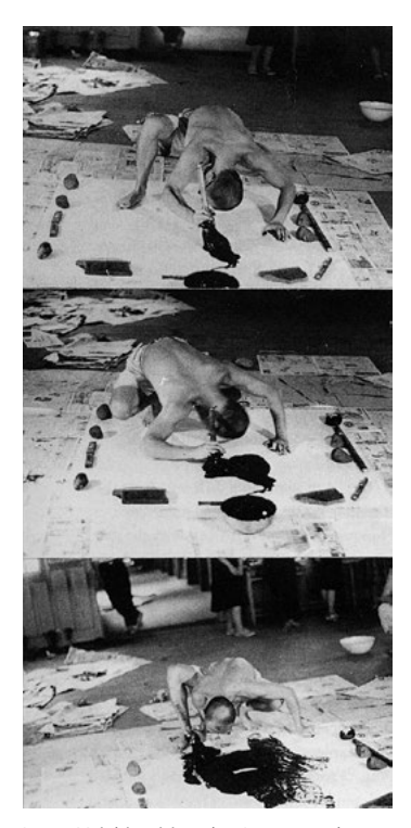
Inoue Yūichi writing the Japanese character for "bone," Asahikawa High School, Hokkaidō, 1959

on modern painting, we frequently encounter the term "sign" and are perplexed by it. The nuance of the word is quite subtle and difficult to grasp. The fact remains, however, that a sign is a sign, and I believe it is important to note that we naturally look for signs within what at a glance appear to be automatic and abstract lines. In some cases, such as with Miró, the forms of people, birds, or stars pass through a unique kind of abstraction and become signs that are almost like primitive hieroglyphic characters. There is also a wide variety of other examples, such as that of Pollock, who creates his own unique sense of space through an almost mechanical movement of his brush, or Henri Michaux, whose so-called exorcismes present singular figures who appear to be seeking a kind of primitive catharsis. (A poet-painter, Michaux produced a collection of almost calligraphic sketches titled Mouvements. Selections of his poetry have been translated by Kokai Eiji and published by Yuriika.) Their styles of plastic expression are all the more richly varied. Taking everything into account, the calligraphic expressivity of each artist serves as his own