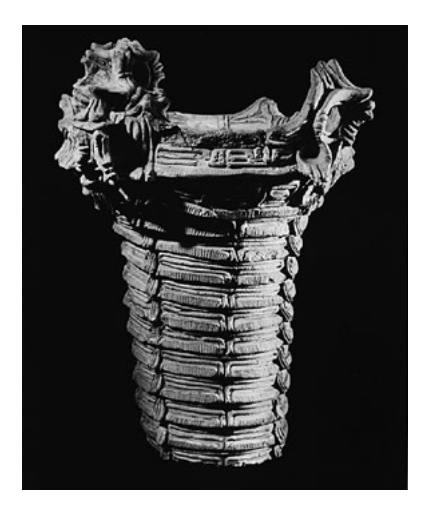
Okamoto Tarō (1911–1996). Photograph of Jōmon earthenware excavated in Toyama Prefecture. 1956. Taro Okamoto Museum of Art. Kawasaki

days when it shone brightly in the color of raw gold—it was surrounded by a towering, richly colored seven-structure temple compound, painted, it is said, with the five-colored earth dug up from Sahoyama mountain. The tower bells rang in the wind, and the front garden resounded with Tang dynasty customs of military and civil officialdom, as men in mesmerizing masks performed court music and danced in primary colors and golden splendor. The thought of such a sumptuous spectacle quite takes my breath away.