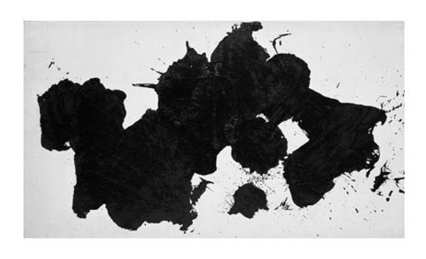
Morita Shiryū (1912–1998). White Hot (Shakunetsu). 1956. Sumi ink on paper, 37 × 64 %6" (94 × 163 cm). The National Museum of Art. Osaka