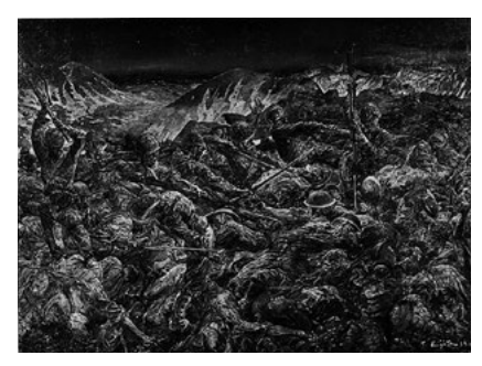
Fujita Tsuguharu (1886–1968). The Battle of Attu (Attsu t\bar{o} gyokusai). 1943. Oil on canvas, 6' 4%6" (193.5 × 259.5 cm). The National Museum of Modern Art, Tokyo

During the turbulent occupation, the postwar Japanese art world reestablished a full complement of reactionary, mainstream, and avant-garde institutions. Prewar artists' groups, exhibition organizations, and journals that had been terminated or consolidated by the military state during the early 1940s were quickly reconstituted, and new organizations were founded. The