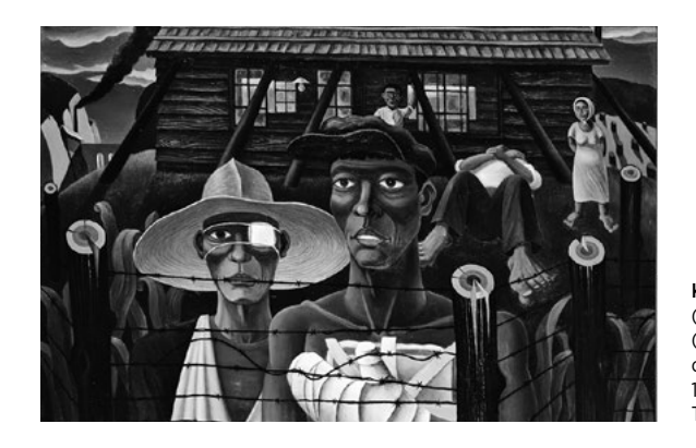
Katsuragawa Hiroshi (1924 – 2011). Ogōchi Village ( Ogōchi mura ). 1952. Oil on canvas, 38 ¼ × 57 ¾" (97.2 × 145.7 cm). Itabashi Art Museum, Tokyo

not be able to grasp the cause that goes deeper than the individual, or out of a determination to break free of these conditions. The clear necessity of this situation bears out Picasso's words, and this indicates to me that a new matrix for the conception and growth of a new art in a new form is now developing.