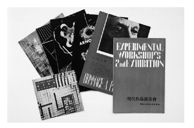
Programs and brochures by the Experimental Workshop (Jikken Kōbō). 1951–56

get started. After the concert, it was customary for our conversation to extend to all matters of art. The topics for discussion weren't necessarily decided in advance, but we seriously addressed such issues as "the place of performance in music," "plastic form in music," and "the problem of automatism" in a casual atmosphere that never took the form of confrontational debate.