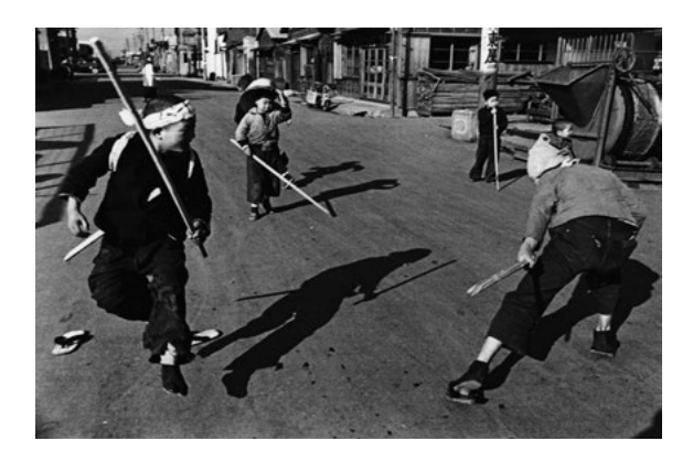
Domon Ken (1909–1990). Children in Kōtō, Tokyo, Kondō Isami and Kurama Tengu (Kōtō no kodomo, Kondō Isami to Kurama Tengu). 1953. Gelatin silver print, 11 × 14" (27.9 × 36.6 cm). Ken Domon Museum of Photography, Sakata

issue. In general, for cameras there's no need to be concerned about the mechanism. . . . As instruments, a camera and a brush are both types of tools or means, and to me there's no difference between them. Because you're a photographer, you use a camera. Because you're a painter, you use a brush. A sculptor uses a chisel. They're only different as tools of expression, as means. There's not really that much of an essential difference. . . .