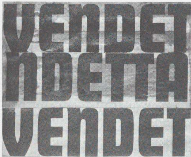
Untitled. 1987. Silkscreen on graph paper, 8 x 10" (20.5 x 25.5 cm).