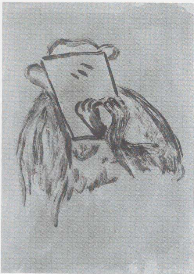
Untitled. 1984. Synthetic polymer paint and ink on graph paper, 11 x 8" (27.9 x 20.3 cm). The Museum of Modern Art, New York

Designed to present recent work by contemporary artists, the new projects series has been based on the Museum's original projects exhibitions, which were held from 1971 to 1982. The artists presented are chosen by the members of all the Museum's curatorial departments in a process involving an active dialogue and close critical scrutiny of new developments in the visual arts. The projects series is made possible by generous grants from the National Endowment for the Arts, the Lannan Foundation, and J. P. Morgan & Co. Incorporated.