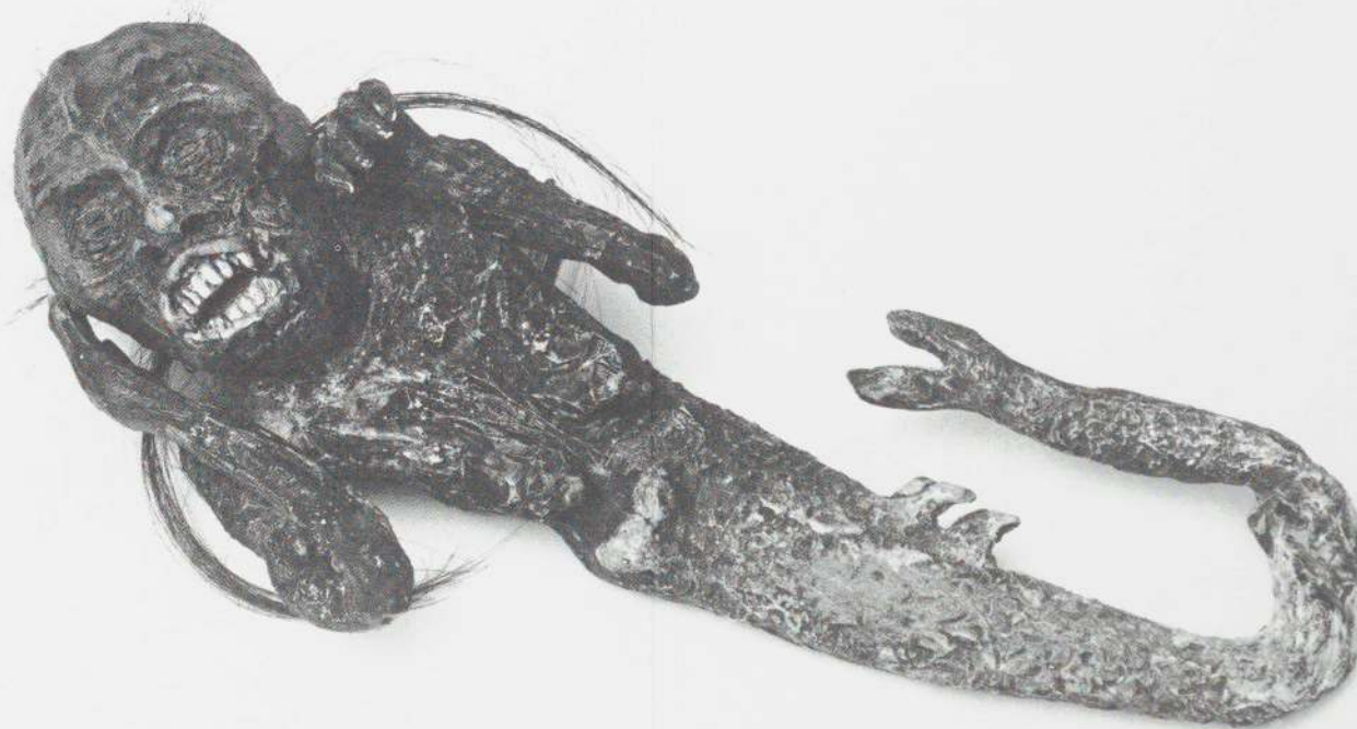
Detail of Untitled. 1987. Mixed mediums.

The sculptures in the present exhibition have an eerie and compelling presence. While they recall earlier work in form and medium, they signal a new direction that has developed out of the artist's interest in evolution and the origin of the human species. In some of the pieces presented here Trockel has replicated artifacts she has seen in reproduction or in archaeology and