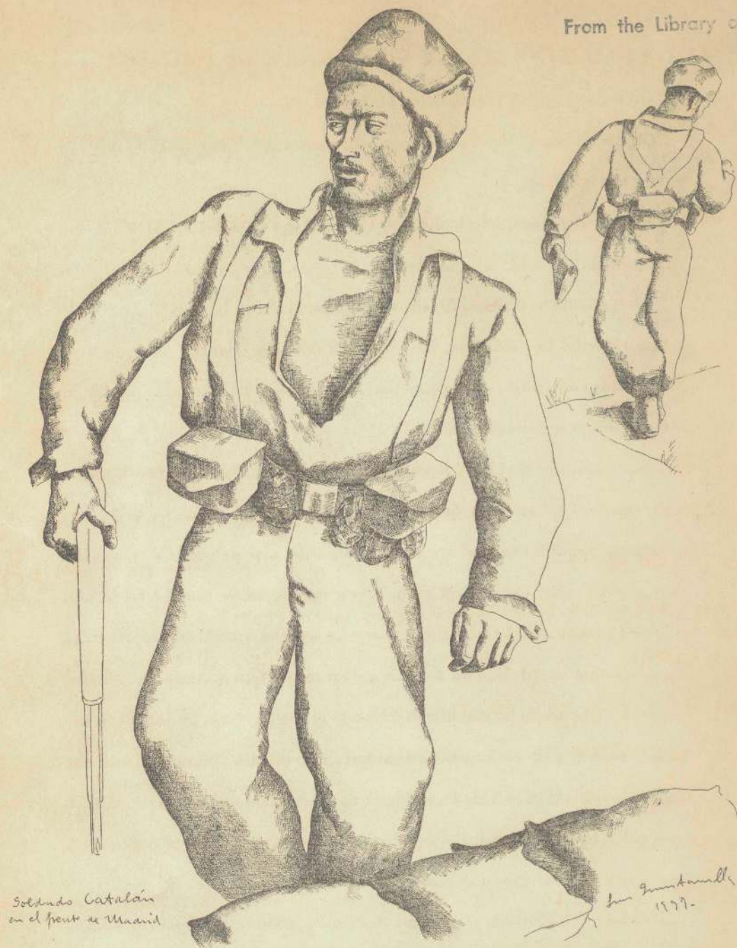
Soldado Catalán en el frente de Madrid