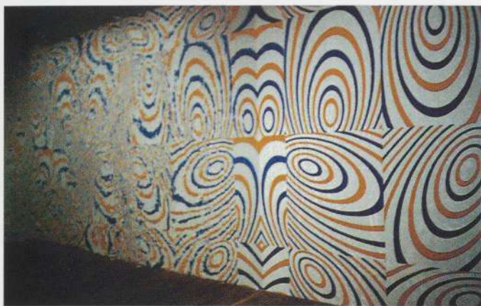
John Armleder. Untitled . 1982. Silver (mylar) mirror wall; Untitled . 1996–98. Wall painting. Installation at Casino Luxemburg, 1998.

In the work of John Armleder and Piotr Ukiński , form follows function into the realm of fantasy. Austere geometries take the shape of glittering disco balls and pulsating, illuminated dance floors, and museum spaces evoke associations of nightclubs and discotheques—social arenas in which people meet, greet, dance, and lose themselves.