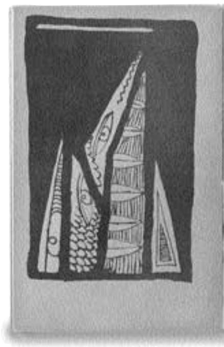
Fig. 8. DAVID BURLIUK AND VLADIMIR BURLIUK. Milk of Mares: Drawings, Verse, Prose by David Burliuk, Nikolai Burliuk, Vasili Kamenskii, et al. 1914. Lithograph by V. Burliuk, 7 1 / 16 x 4 15 / 16 " (19.5 x 12.5 cm). Ed.: 400. The Museum of Modern Art, New York. Gift of The Judith Rothschild Foundation

Other artists were inspired by the structural and aesthetic properties of stone statues that stood atop Scythian burial mounds in the Ukraine. The true origins and purposes of these statues remain unknown, thereby presenting ideal models for artists and poets seeking subject matter without fixed meanings or concrete associations. 52 "Stone maidens," found in the fields of Eurasia and Siberia and in the ethnographic museums of