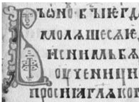
Fig. 1. Letter V (detail) from Archangelic Evangelists . Early 13th-century manuscript. State Historical Museum, Moscow