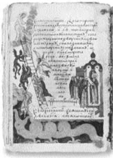
Fig. 2. “Ladder of St. John,” from a 16th-century manuscript.

the written word and letter forms. This collective effort challenged the established practices in book design, art, and poetry, and advanced a shared political and ideological platform. Russian art and poetry were revitalized, making them more reflective of the Russian people, their spirit and traditions. Blurring the lines between “high” and “low” art, these books showed an equal reverence for the images of everyday and those of the sacred. These innovative approaches to the concept of the book meant that Russian artists could claim their own achievements, outside of Western influences.