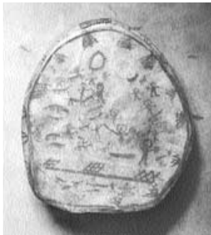
Fig. 4. Shaman's drum. 19th century. Leather, wood, and metal, 22½" (56 cm) diam. Peter the Great Museum of Anthropology and Ethnography, St. Petersburg