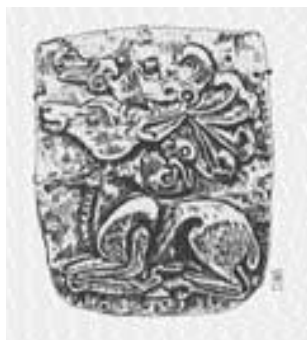
Fig. 5. Recumbent deer with bird-headed antler tines. Scythian. 5th century B.C. Gold. From Ak-Mechet, Crimea. Rendering by Lynn-Marie Kara. Original in the Hermitage, St. Petersburg