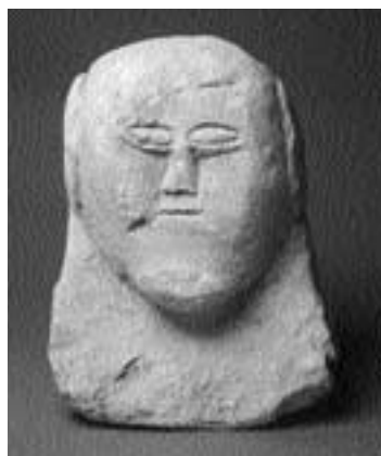
Fig. 10. Idol from an excavation near Dolmatov and Akulinino, Moscow region. N.d. Stone, height approx. 12" (30.5 cm). State Historical Museum, Moscow

While rooted in tradition, Russian Futurists were not mired in it; national art forms merely provided Russian Futurists with a point of departure toward undiscovered and unexploited creative experiments. The novelty, dynamism, and monumentality of tradition-inspired achievements made by Rozanova and others within the medium of the illustrated book are perhaps best evidenced by the fact that A Little Duck's Nest and Te li le —both with clear and deliberate references to traditional art forms—were included in the International Futurist Free Exhibition at the Sprovieri Gallery in Rome in 1914 55 by Filippo Tommaso Marinetti, the founder of Italian Futurism, a devoted champion of modern technology and the epitome of anti-traditionalism.