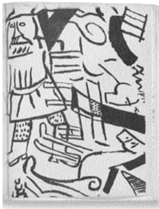
Fig. 7. DAVID BURLIUK AND VLADIMIR BURLIUK. "Peasant and Horses," The Croaked Moon by David Burliuk, Nikolai Burliuk, Velimir Khlebnikov, et al. 1913. Lithograph by D. Burliuk, 7 1 / 16 x 5 15 / 16 " (19.5 x 15.1 cm). Ed.: 1,000. The Museum of Modern Art, New York. Gift of The Judith Rothschild Foundation

The depiction of forms and figures with different orientations is one of the most common devices used by Scythian artists to portray movement, a distinctive and fundamental principle of Scythian art. 49 Just as the example in fig. 5 reveals new subjects as it is rotated and viewed at different angles, the Burliuks' illustrations employ a similar lack of fixed orientation: animals and other figures are depicted upside down, at ninety-degree rotations, and running in various directions along the borders of an image.